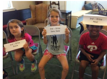
Third grade representatives at the Lower School Meeting for Business.

This Wednesday was the first gathering of student leaders for both a Lower School Town Meeting and a Middle School TORCH meeting .