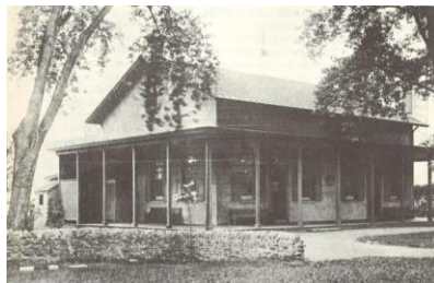
Green Street Meetinghouse, 1854 enrollment.

No, the building that is still in use today by the Meeting as well as by the GSFS community was built in 1876 as the Meeting grew and required additional space.