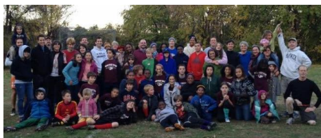
Last year's faculty, parent, and student soccer game participants.

Calling all parents! You are invited to join us for a community-wide soccer game at 3:45pm on Tuesday, November 4 at the Boys and Girls Club (328 West Coulter Street).