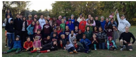
Last year's faculty, parent, and student soccer game participants.

Calling all parents! You are invited to join us for a community-wide soccer game at 3:45pm on Tuesday, November 4 at the Boys and Girls Club (328 West Coulter Street).