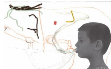
Last year's Pre-K used yarn and paper in their self-portraits.